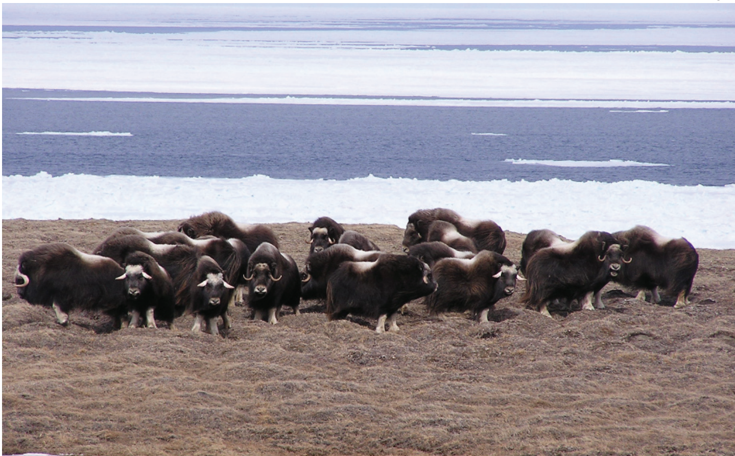
Muskox on Herschel Island.

making up the population is highly variable. The most recent population estimate was done in April 2011 . That census found a total population of 291 muskoxen (190 muskoxen west of the Canning River, no muskox in the Arctic Refuge and 101 in Yukon).