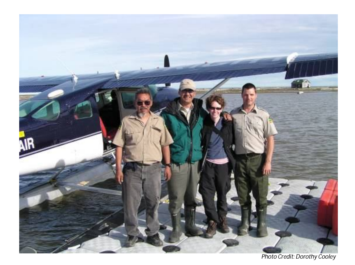
Yukon North Slope Research Guide

This Guide was developed through extensive consultation with the Inuvialuit community in Aklavik and interested people in Aklavik, Inuvik, and Old Crow; with Inuvialuit agencies and co-management bodies; with federal, territorial, and Alaskan government agencies; with Canadian and Alaskan universities; and with non-governmental organizations. Consultations included two workshops, and interviews with more than forty researchers and community representatives. The Guide also contains information from other publications about permitting requirements, ethical conduct, support services, and funding.